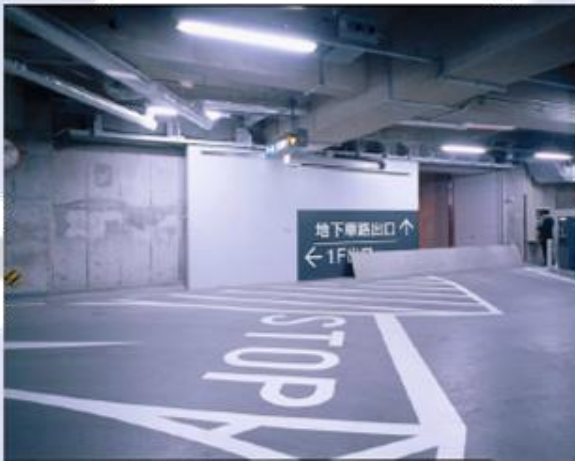
(During the motion, the floor lifter raises up)