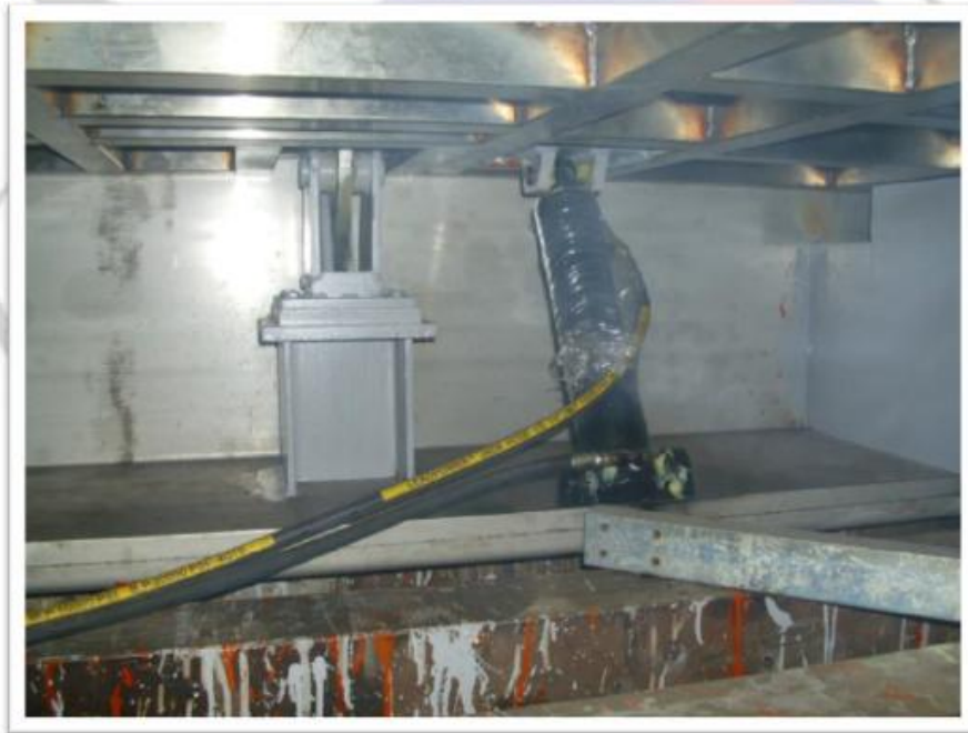
(Floor cover lifter)