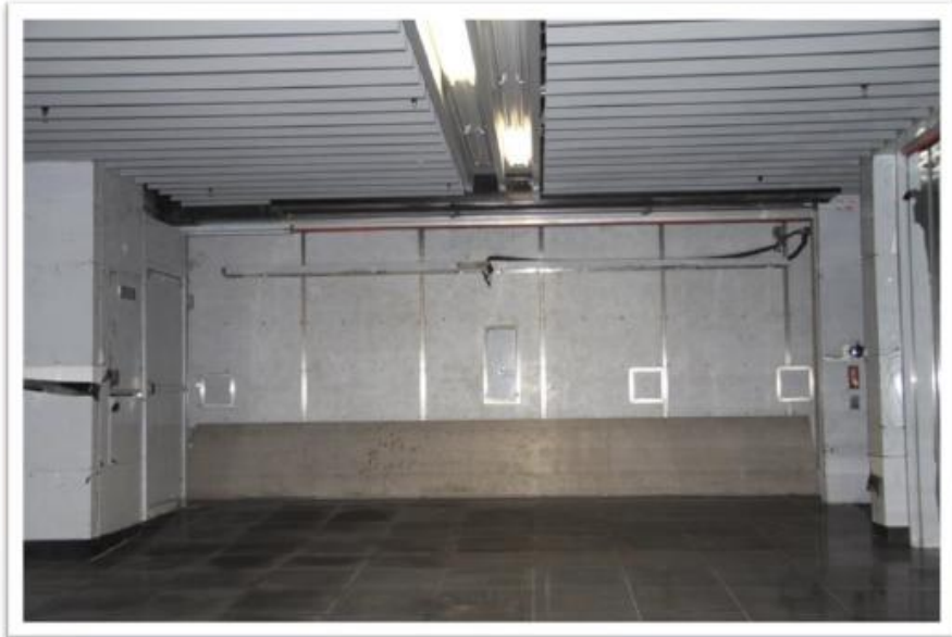
(Gate closed with floor cover lifted)