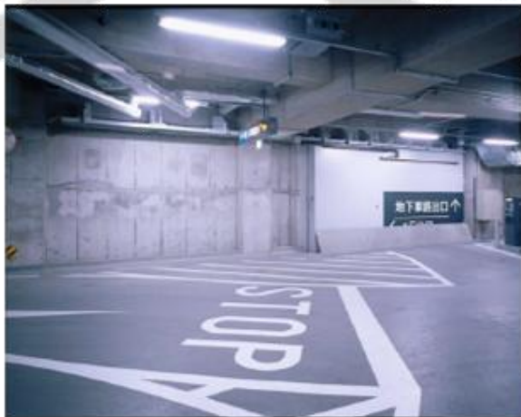
(After the motion)